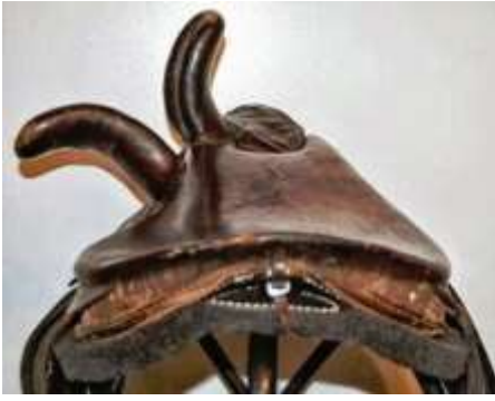
Rear view of “leaping” pommel (l) and “fixed head” pommel (r) on a modern sidesaddle.

pommel was developed in conjunction with the fixed head or top pommel to enable the equestrienne to remain on the horse when it was at high gallop or leaping over fences. She wedged herself onto the saddle using the pommels and held on for dear life.