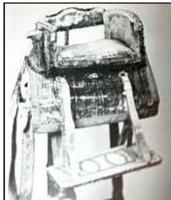
Princess Anne-style side-saddle