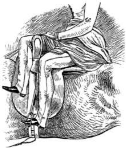
The “leaping” pommel (r) and the “fixed head” pommel (l) in action.